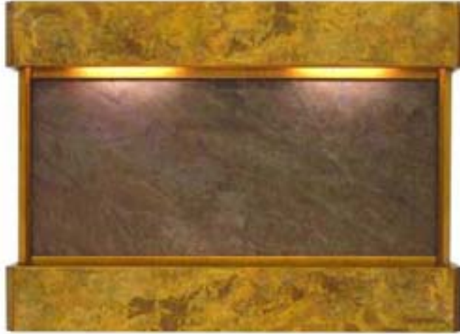
Majestic Falls – Yellowstone

Fountain Installation Instructions For All Wall Fountains